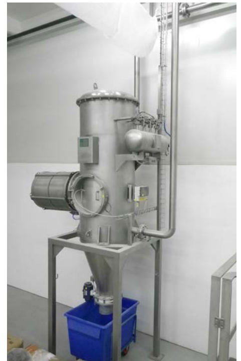
ATEX Bag filter in stainless steel