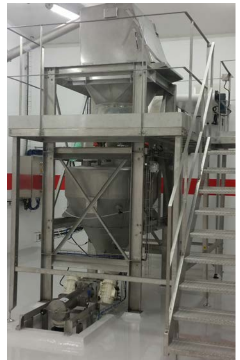
Sieving station for mixer feeding