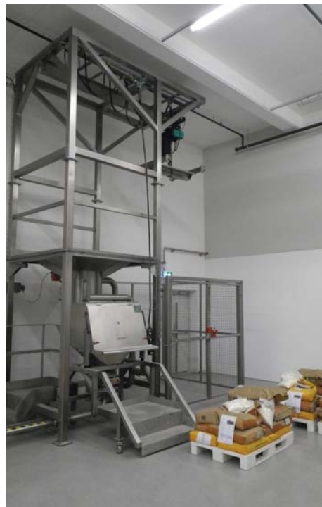
Sack and big Bag discharge of multi-ingredients

Receiving and emptying sacks and big bag stations, dosing, weighing, mixing, grinding and packaging are an integral part of NEU-JKF Process solutions for all types of industries : food, chemical, mineral, compound... Process control of all equipment by PLCs and automated supervision allow recipe formulation, traceability and batch pedigree.