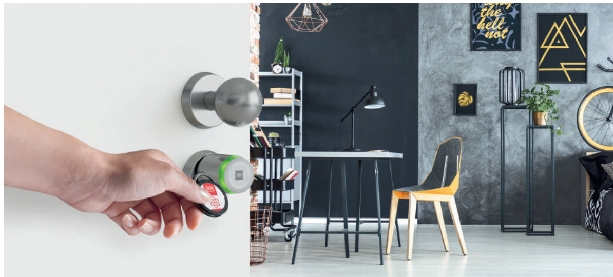
All the benefits of digital security, but without software or wires.

Now select a new transponder and hold its activation card against the cylinders. With the new transponder, the user once again has all access privileges as before, and the lost transponder is now rendered useless, so it cannot be used anymore. After some years of use, one of the cylinders