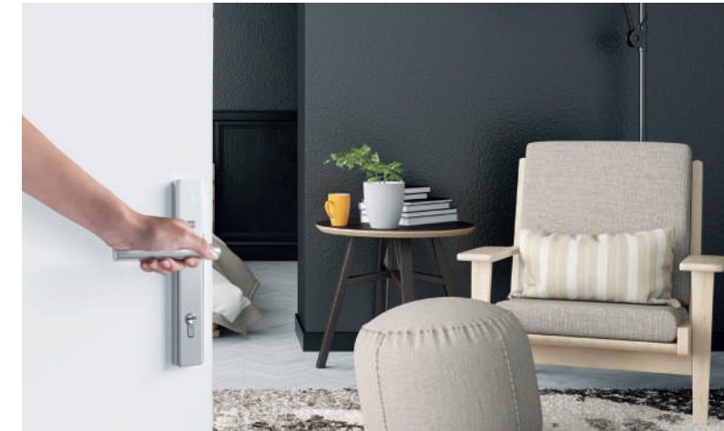
Activate a transponder by holding its card against the lock.

them in our ENiQ® cylinder. It can be done from the outside, so you will never get locked out. After replacing the batteries, your cylinder is ready again for another couple of years, no need to reprogram it.