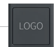
Your logo and/or locker number