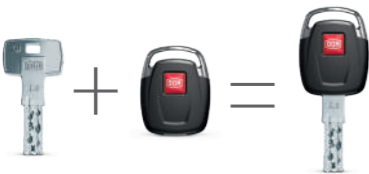
Two systems, one key.

any and all DOM mechanical keys – you can expand our feature-rich digital experience to all your locks. Unify your mechanical and digital systems with ENiQ ® and unlock endless possibilities – your Digital Security Ecosystem by DOM.